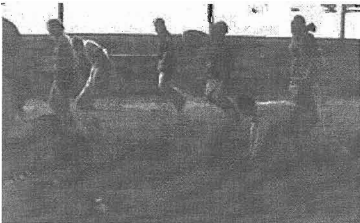
Adults participating in the sack race at last years Summer Gathering. Join the fun on July 27th. Games include sack races, tug-of-war, horseback rides, and frog race.

Composting Manure & Wood Shavings: Sign up for fall deliveries. $25 for 11 yard dump truck load delivered within 6 miles of farm. 503-621-6932