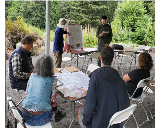
Community members at Habitat & Landscape Design workshop

At our hands-on, family-friendly workshops, we share practical, sustainable landscaping practices that support healthy watersheds. All participants will go home with a native plant, too! April 11, 10am-noon in SW Portland. This is our last Stormwater Stars workshop of the spring rainy season! Free, registration required, address provided upon registration.